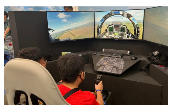
Visitors had the opportunity to try out flight simulators