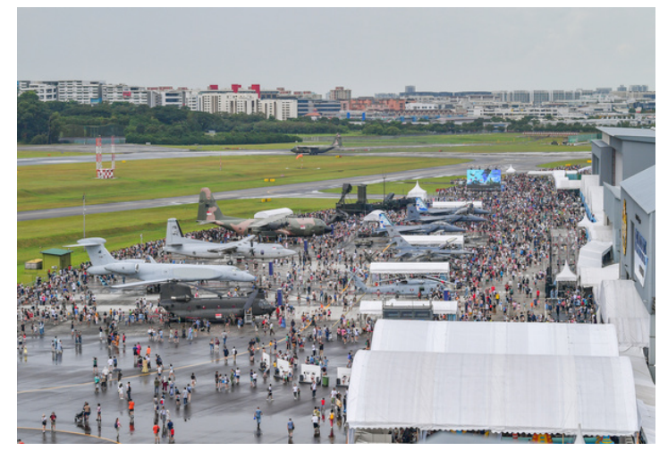
Static display area at the RSAF55 Open House (Defence Minister Dr Ng Eng Hen's FB page)

The RSAFOH55 featured a range of activities where visitors can get hands-on experience with interactive exhibits and simulators, delve into the RSAF's rich history and capabilities, and get to know the different RSAF vocations and how they contribute to the air defence of Singapore.