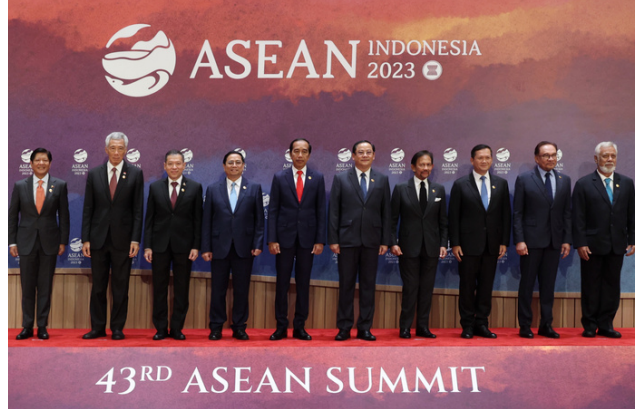
Leaders at the 43rd ASEAN Summit on Sept 5, 2023.

• This is the second year in a row that Myanmar is not invited to the regional meet. The bloc made a decision last year to leave Myanmar's junta out of ASEAN summits and foreign ministers' meetings.