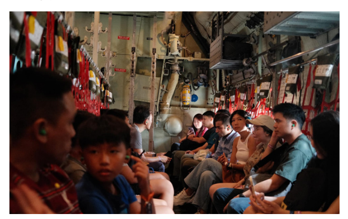
Members of the public getting ready for a familiarisation flight