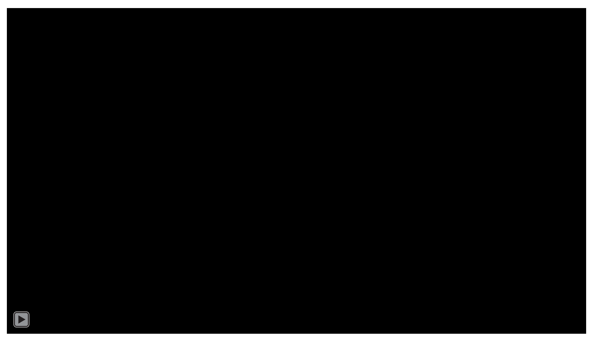
Video: The Fight for Multiracialism (Produced by Nexus, 2017)