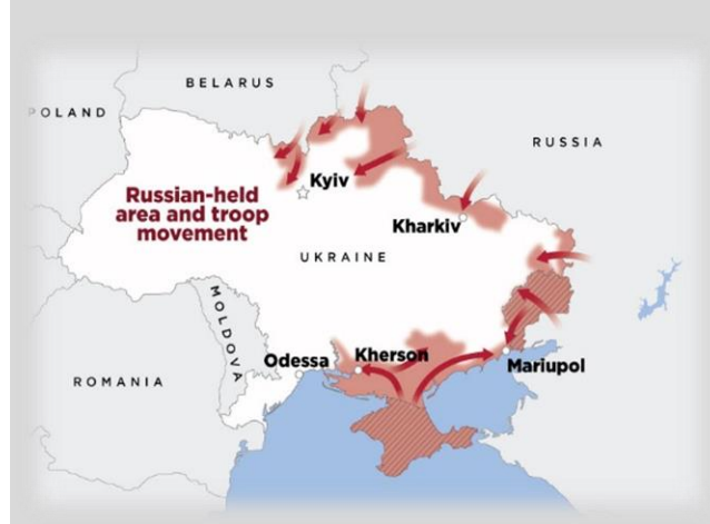
\label{lem:map:showing} \textit{Map showing the Russian-occupied areas of Ukraine}. \\ \textit{Adapted from The Washington Post.}

Since 24 February 2022, Russia has used military force to invade Ukraine from multiple directions.