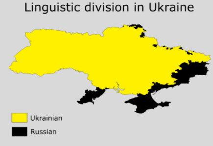
Map showing the linguistic preferences in Ukraine.

He justified the annexation of Crimea in 2014 as its 'return to preferences in U motherland'. For the invasion of Ukraine in 2022, it was partly aimed at stopping Ukraine's "genocide" against the majority Russian-speaking population in the Donbas region, east of Ukraine.<sup>5</sup>