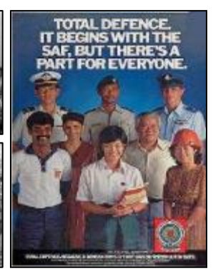
1980s - 1990s

Support for national conscription Everyone has a part to play