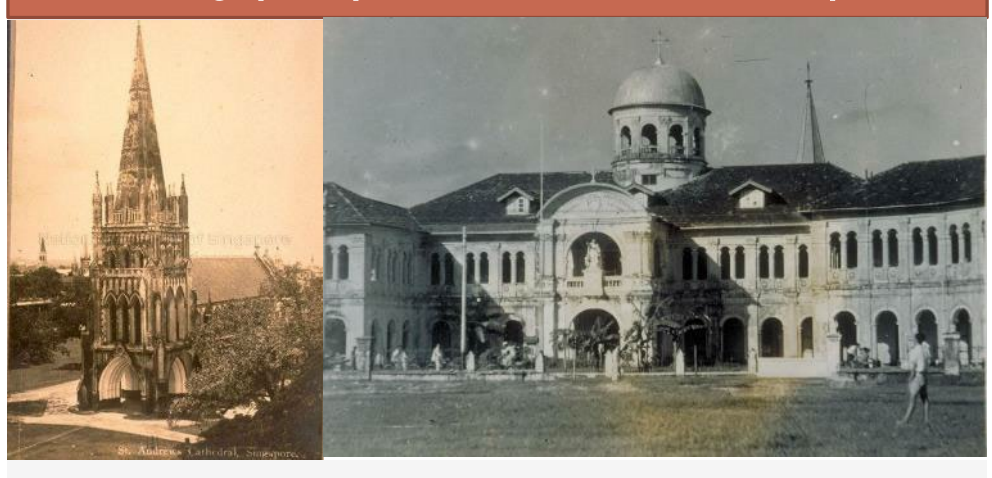
Images (left to right): St Andrew's Cathedral, St Joseph's Institution